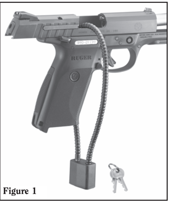
Correct Installation of Cable Lock For Ruger® SR-Series & 9E<sup>™</sup> Pistols