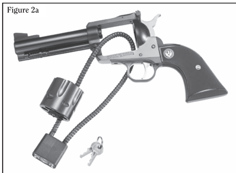
Correct Installation For Ruger® New Model Blackhawk® Revolvers